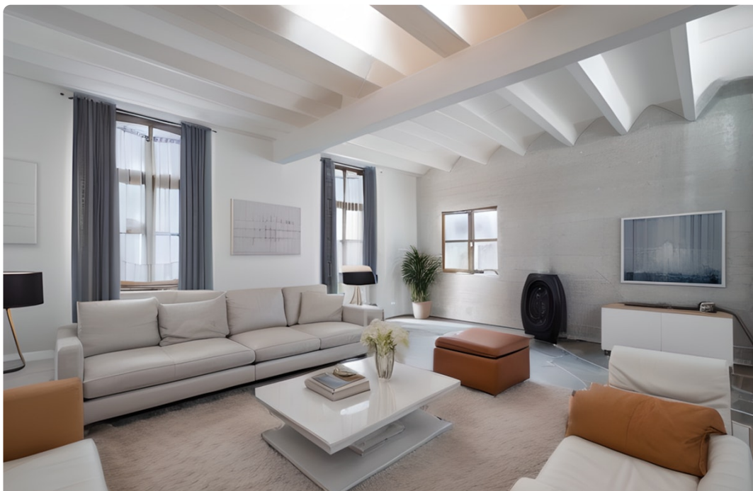
Projection virtuelle non contractuelle