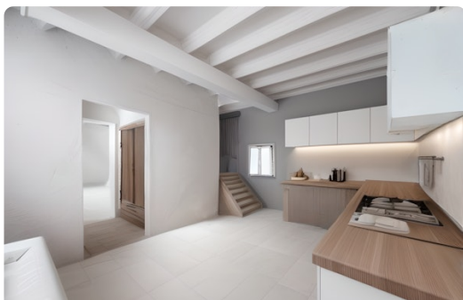
Projection virtuelle non contractuelle